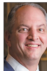
Gov. John Bel Edwards

Gov. John Bel Edwards is announcing the launch of the Louisiana Homeowner Assistance Fund, a federally funded relief program for homeowners financially impacted by COVID-19 who are behind on their mortgages and at risk of foreclosure. The program is funded through the American Rescue Plan Act, which provides $10 billion in federal relief for vulnerable homeowners. Louisiana is set to receive $146.7 million in funding to provide up to $25,000 per eligible homeowner.