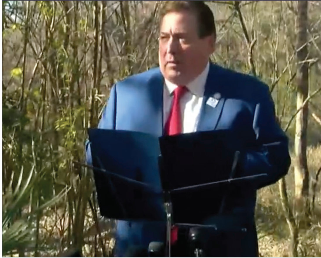
Lt. Gov. Billy Nungesser