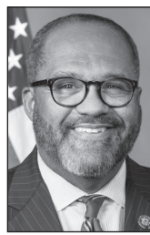
Congressman Troy A. Carter

West Shore Lake Pontchartrain - $450 million for a resiliency assessment to improve the ability of the vital