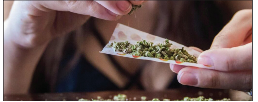
A proposal that would outlaw marijuana smoking in a moving car for drivers and passengers advanced from the state House of Representatives in a 66-31 vote Wednesday, April 6, 2022.