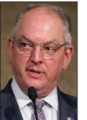
Gov. John Bel Edwards