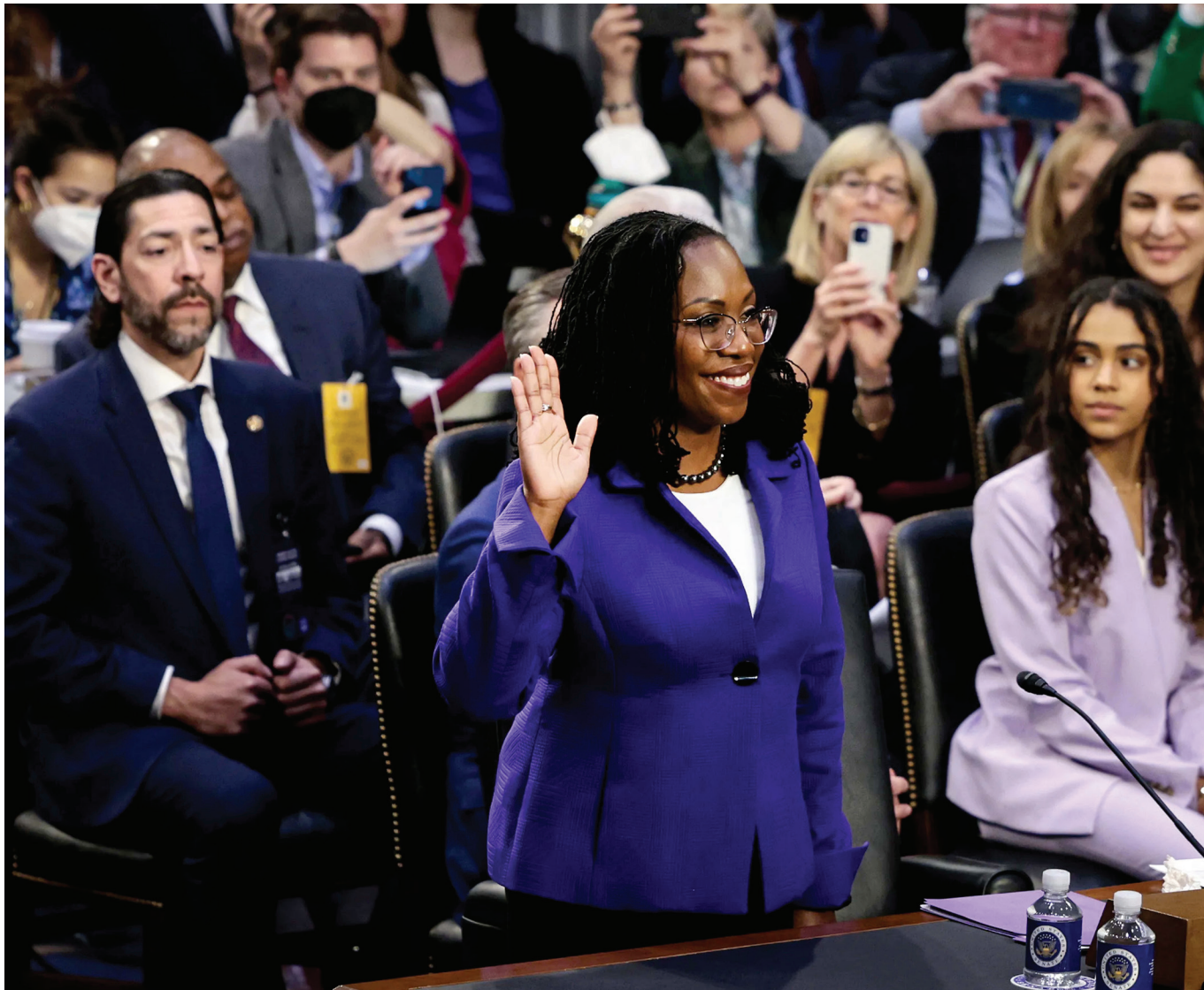
Judge Ketanji Brown Jackson's confirmation makes her the first Black woman to be elevated to the nation's highest court. Three Republicans joined Democrats in supporting her.

The 53-47 vote elevated the first Black woman to the pinnacle of the judicial branch as senators erupted in cheers. Three Republicans joined Democrats in supporting President Biden's nominee.