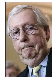
Sen. Minority Leader Mitch McConnell

Sen. Minority Leader Mitch McConnell, R-Ky., Tuesday, April 5, 2022. Earlier, three Republican senators broke from their party to support Judge Ketanji Brown Jackson's historic nomination to the Supreme Court.