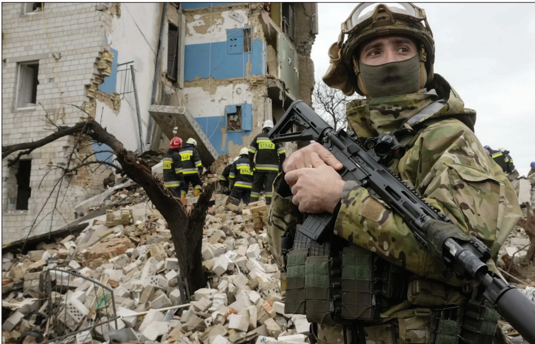
A Ukrainian soldier stands near an apartment building destroyed by Russian shelling.

ANDRIIVKA, Ukraine — The mayor of the besieged port city of Mariupol put the number of civilians killed there at more than 5,000 Wednesday, as Ukraine collected evidence of Russian atrocities on the ruined outskirts of Kyiv and braced for what could become a climactic battle for control of the country's industrial east.