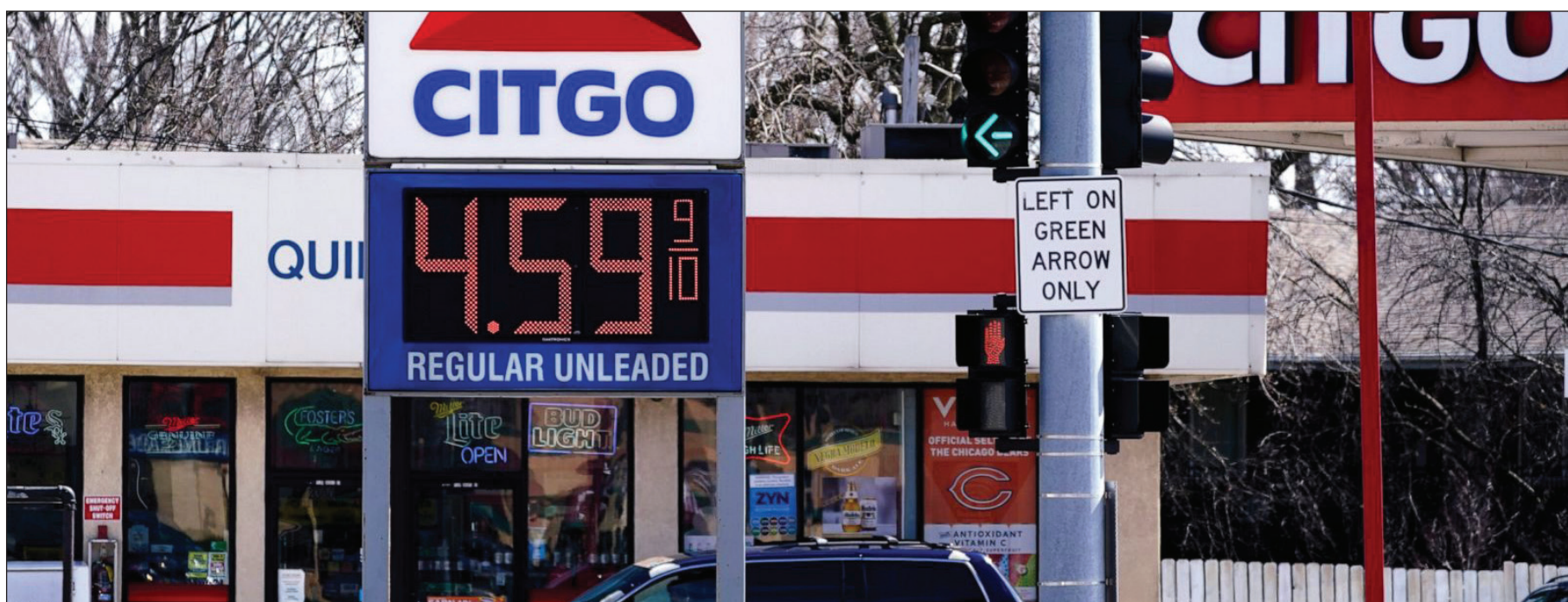
Oil executives, testifying before Congress for the second time in six months, responded that oil is a global market and that oil companies don't dictate prices.

Big Oil executives defended their record profits against accusations of price gouging in a contentious hearing before the House Energy and Commerce Subcommittee Wednesday, as record high prices at the gas pump continue to crimp drivers across the country.