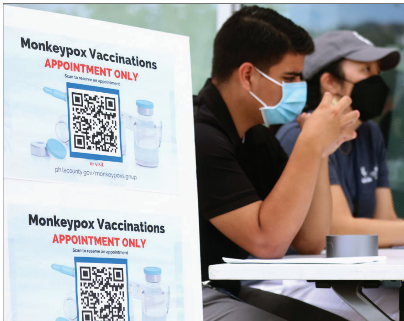
Health workers sit at a table at a pop-up monkeypox vaccination clinic on Aug. 3, 2022 in West Hollywood, California.