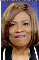
Mayor Sharon Weston Broome

BATON ROUGE, La. — Mayor-President Sharon Weston Broome received the unanimous support of the Metropolitan Council this evening to increase pay for police, fire, EMS, DPW and other East Baton Rouge City-Parish employees. Beginning September 10, 2022, the City-Parish will increase municipal fire and regular classified/unclassified employees' pay by 5% and increase municipal police employees' pay by 7%. In addition to the 7% across-the-board raise proposed for municipal police personnel, future entry-level police officers will be hired at a special recruiting rate of step 5. After one year, an entry level police officer,