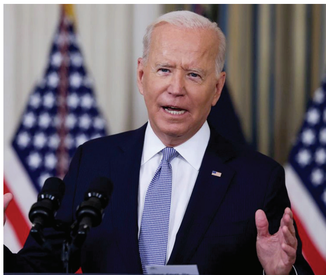
Biden administration officials at a press briefing also struggled to explain differing statements about how the vaccines should be administered, a crucial part of the White House strategy.