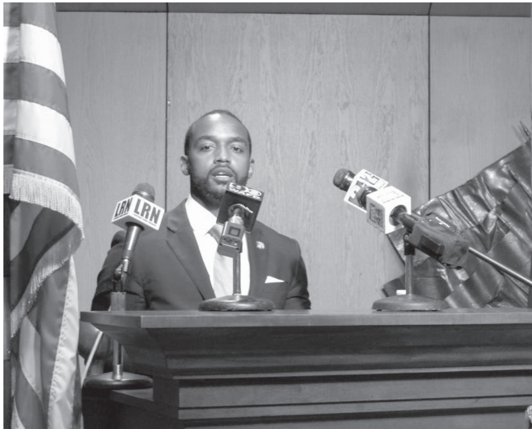
Shreveport Mayor Adrian Perkins, a Democrat, speaks after registering for the U.S. Senate race, on July 23, 2020, in Baton Rouge, La. Perkins can run for reelection, despite providing incorrect information about his voting address on his qualifying papers, a divided state Supreme Court ruled Friday, Aug. 19, 2022.

NEW ORLEANS (AP) — A north Louisiana mayor can run for reelection, despite providing incorrect information about his address on his qualifying papers, a divided state Supreme Court ruled Friday.