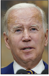
President Joe Biden

The proposed rule would also forgive loan balances "after 10 years of payments, instead of 20 years, for borrowers with loan balances of $12,000 or less." It would also require "borrowers to pay no more than 5% of their discretionary income monthly on undergraduate loans."