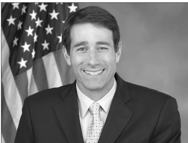
U.S. Congressman Garret Graves

U.S. Health and Human Services (HHS) Secretary Alex Azar and President Donald Trump announced the $190 million in new CDC funding for Louisiana to complement the nearly $20 million in cooperative agreement and lab capacity funding previously provided to the state. This new commitment of federal funds is the result of bipartisan legislation Congress passed approximately three weeks ago in the Paycheck Protection Program and Health Care Enhancement Act. U.S. Representatives Ralph Abraham, Clay Higgins, Mike Johnson, Cedric Richmond, Steve Scalise and Graves all supported enactment