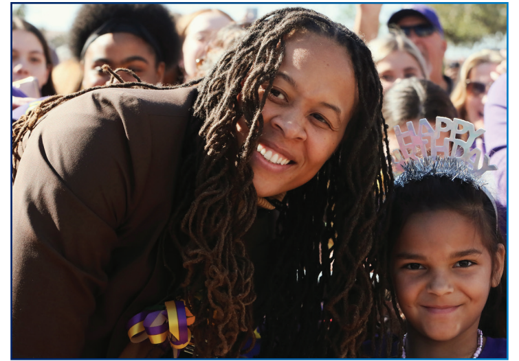
Seimone Augustus, a former LSU player who led her team to multiple final fours and a Minnesota Lynx player who won four WNBA Championships, with a young fan out of the crowd before her statue unveiling at the LSU campus on Sunday.

but also a symbol of the progress and representation of women in sports. It's a powerful message to young girls and women everywhere that they can excel in sports and be recognized and celebrated for their achievements.