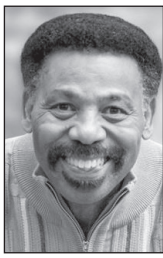
Dr. Tony Evans

Friend, sometimes God calls us to walk through valleys. I can't promise you a life without wind, clouds and turmoil. But I can promise you that you don't have to walk through the valley alone. So, keep walking. Don't say that you can't make it, because God will make it with you. You don't walk this road alone.