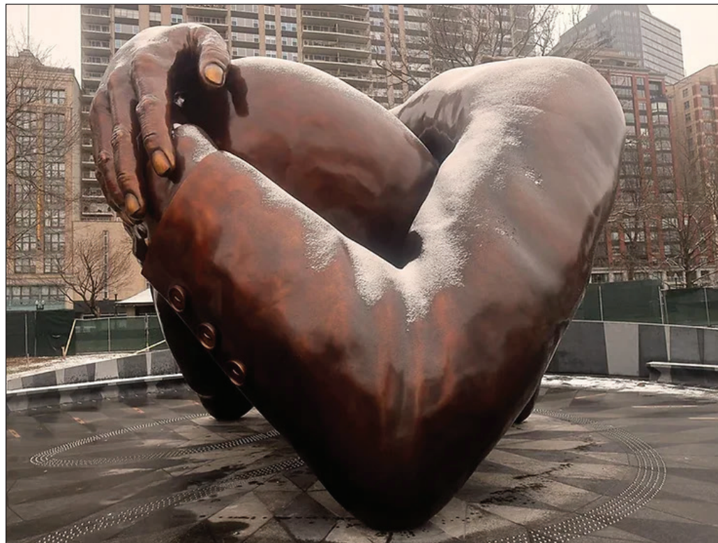
The Embrace, the new memorial sculpture in Boston made in tribute to Martin Luther King Jr. and Coretta Scott King, was unveiled on Friday.

in America. It aims to inspire visitors and pay tribute to the legacy of the Kings.