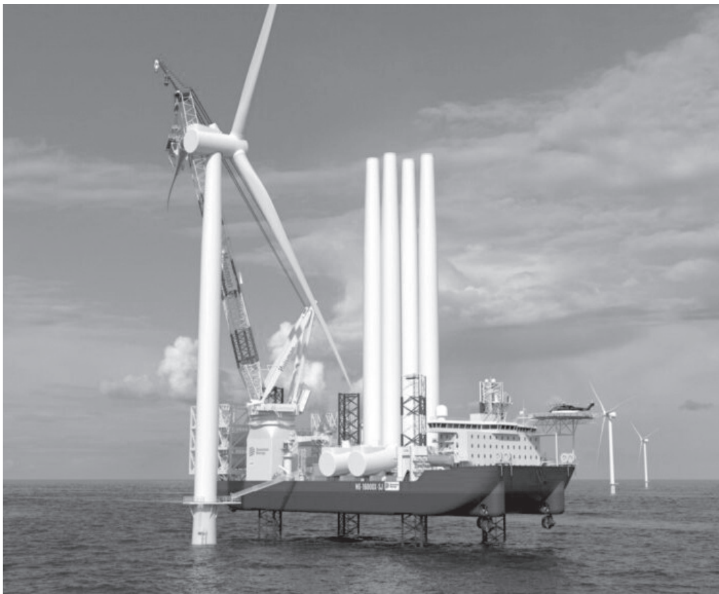
A rendering of Dominion Energy's offshore wind installation vessel, which is expected to be completed this year. (Dominion Energy)