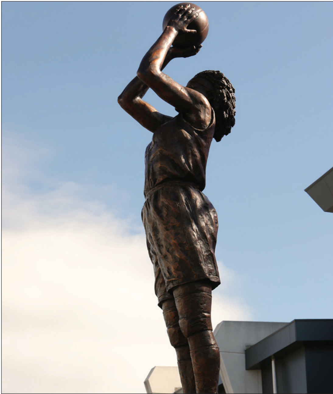
Statue of Seimone Augustus

The statue of Augustus serves as a reminder of the incredible accomplishments and impact that female athletes can have, not just on the court or field but also in shaping the culture and history of a community. Augustus' statue is not only a symbol of her success