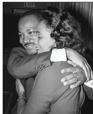
Dr. Martin Luther King, Jr. hugs his wife Coretta during a news conference following the announcement that he had been awarded the Nobel Peace Prize on Oct. 14, 1964.

The bronze structure, entitled "The Embrace," depicts the Kings in a moment of affection, captured in a famous photograph taken after Martin received the Nobel Peace Prize in 1964. Measuring 20 feet in length and 26 feet in width, the monument is situated at Boston Common, the oldest city park