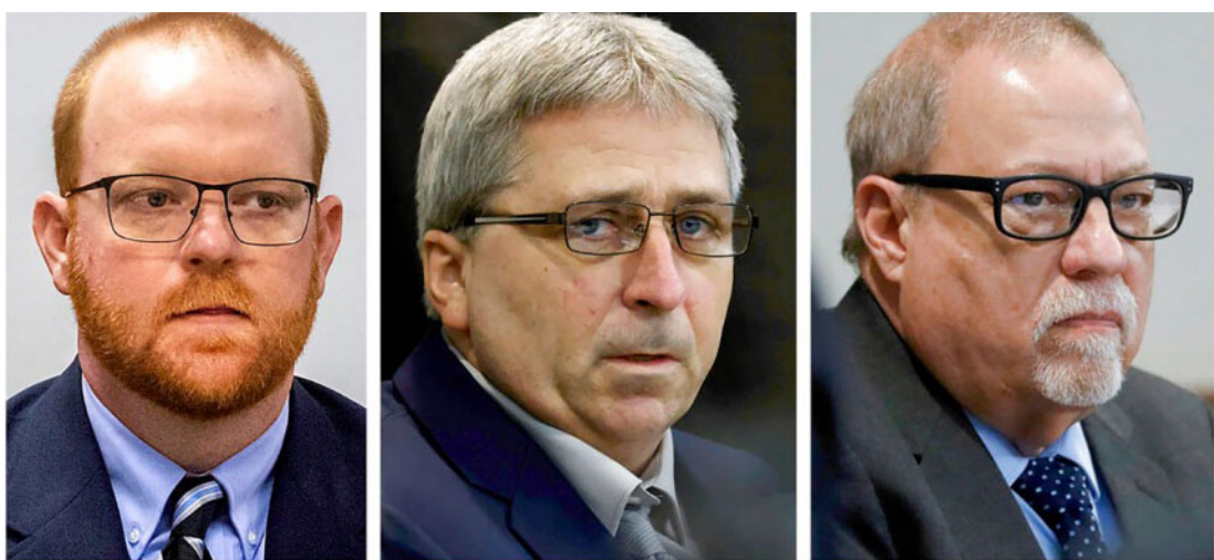
This photo combo shows, from left, Travis McMichael, William "Roddie" Bryan, and Gregory McMichael during their trial at the Glynn County Courthouse in Brunswick, Ga. The men were convicted of murder in November 2021 for chasing Ahmaud Arbery in pickup trucks when he was out for a jog, cutting off the Black man's escape and fatally blasting him with a shotgun.

McMichael to serve his sentence in federal prison