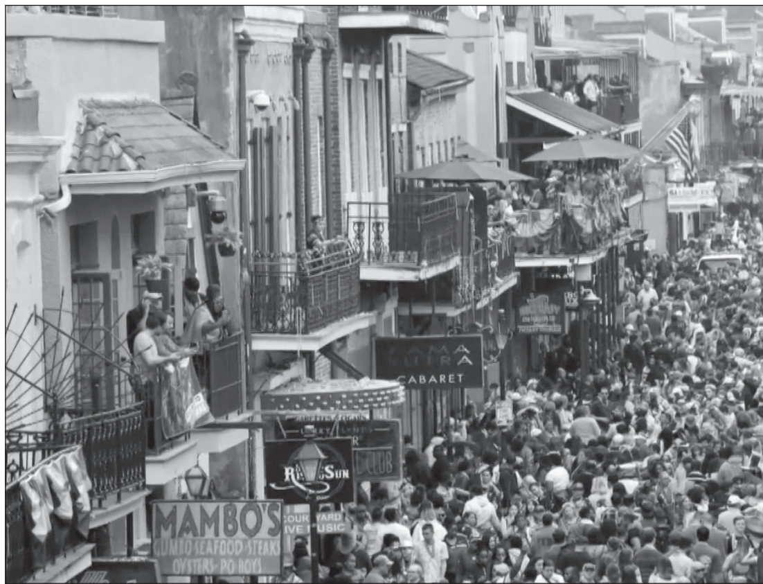
Crowds are seen packing Bourbon Street on Mardi Gras day in New Orleans on Feb. 25, 2020. More than 100 people have joined a lawsuit against New Orleans' mayor and health director over COVID-19 restrictions that recently were extended to parade and other participants on Mardi Gras and during the season leading up to it. The 2020 festival was recognized as a super spreader that turned New Orleans into an early pandemic hot spot. Last season, parades were canceled and bars were shuttered in the city.

NEW ORLEANS (AP) — More than 100 people have joined a lawsuit against New Orleans' mayor and health director over COVID-19 restrictions that recently were extended to parade and other participants on Mardi Gras and during the season leading up to it.