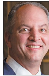
Gov. John Bel Edwards

"Nothing like that has ever happened because of me," he said. "That is not who I am as a person."