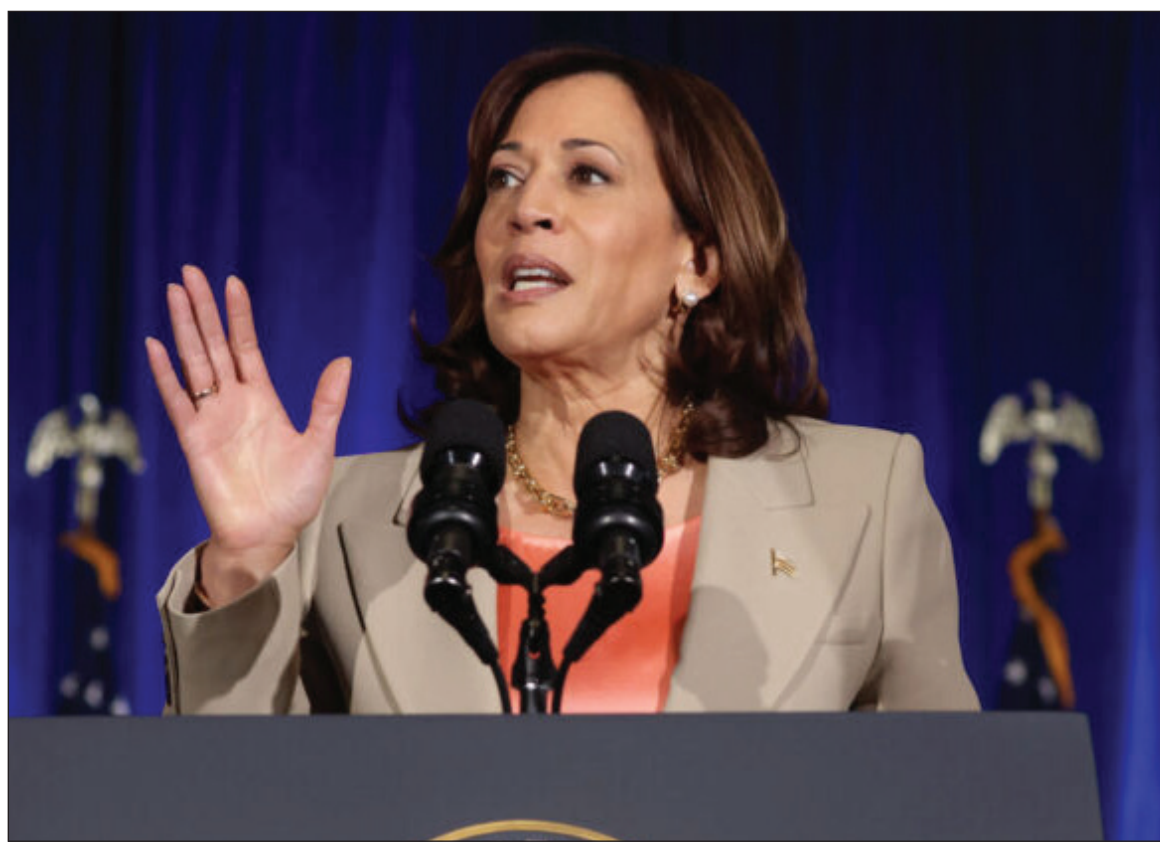
U.S. Vice President Kamala Harris speaks on gun violence during an event at John R. Lewis High School on June 2, 2023, in Springfield, Virginia.

Harris highlighted the challenges caregivers face, often forced to leave their jobs to care for aging relatives. "People are losing income and experiencing stress trying to do it all," Harris said.