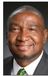
Senator Cleo Fields