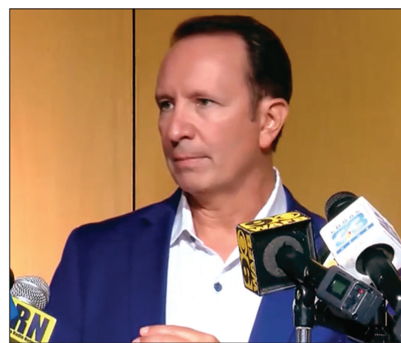
The image of a wildfire in Beauregard Parish from drone video taken Saturday, Aug. 26, 2023.